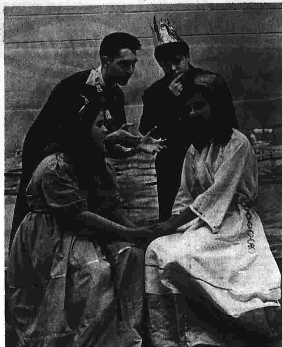
Bolton Students in One-Act Plays Tonight