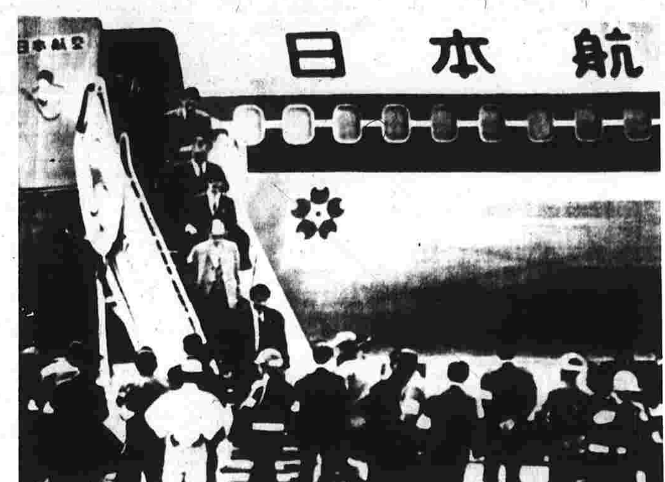
Passengers of the hijacked Japan Air Lines jetliner leave the plane at Seoul today after being held for more than three days.