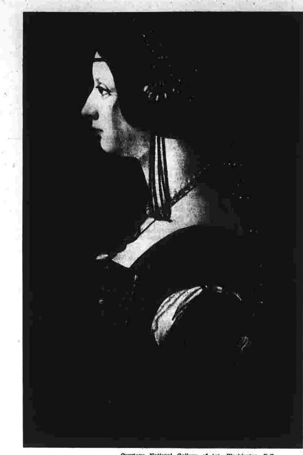
BIANCA MARIA SPORZA: By The Milanese Painter, Ambrogio De Predis

On the enforcement side, the federal government would have to depend on public support for a wide impartial punishment of violators of the "no strike" law and not take the wishy-washy position it did in the postal strike. Anarchy is the only other course. Whether we can ever get our national conscience back on the track and regain the sense of values and priorities that have been lost is another question every citizen must ponder as the days ahead. It is optimistic, but it's going to take a lot of work. LIBSEH CARTER WHITE in THE MERIDEN RECORD.